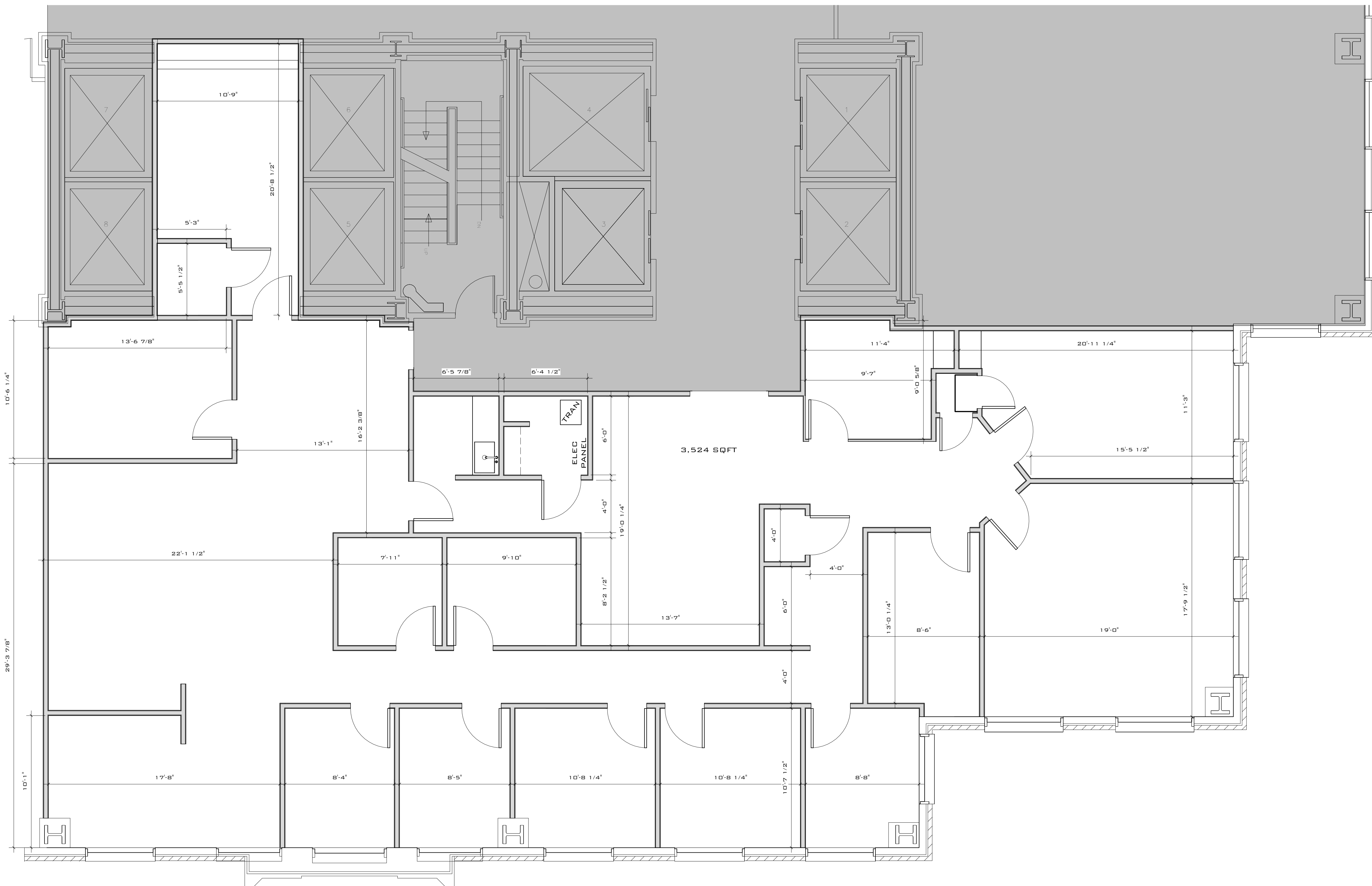
1 SUITE 801 1/4" = 1'-0"