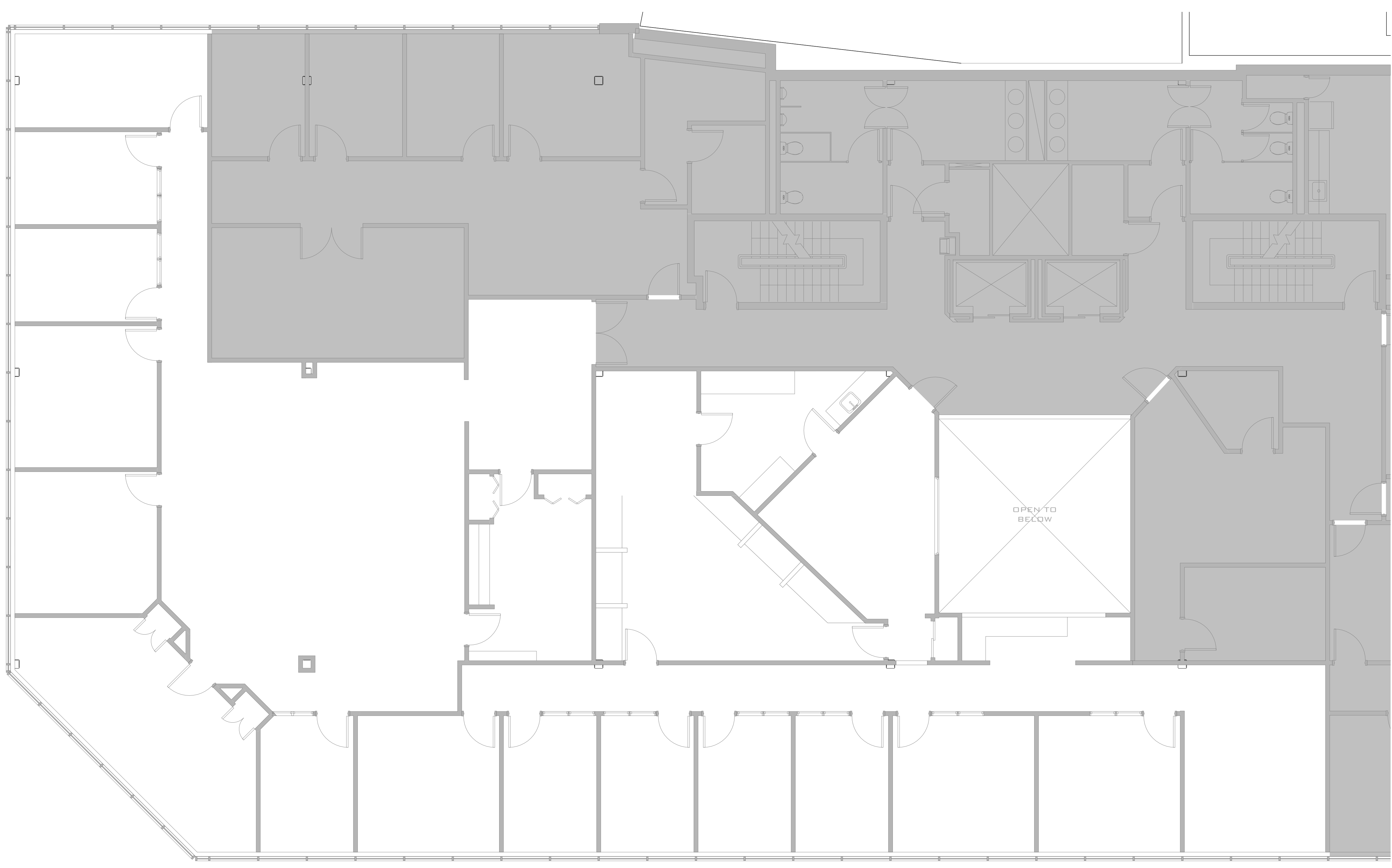
1 2ND FLOOR - VACANT SPACE 3/16" = 1'-0"