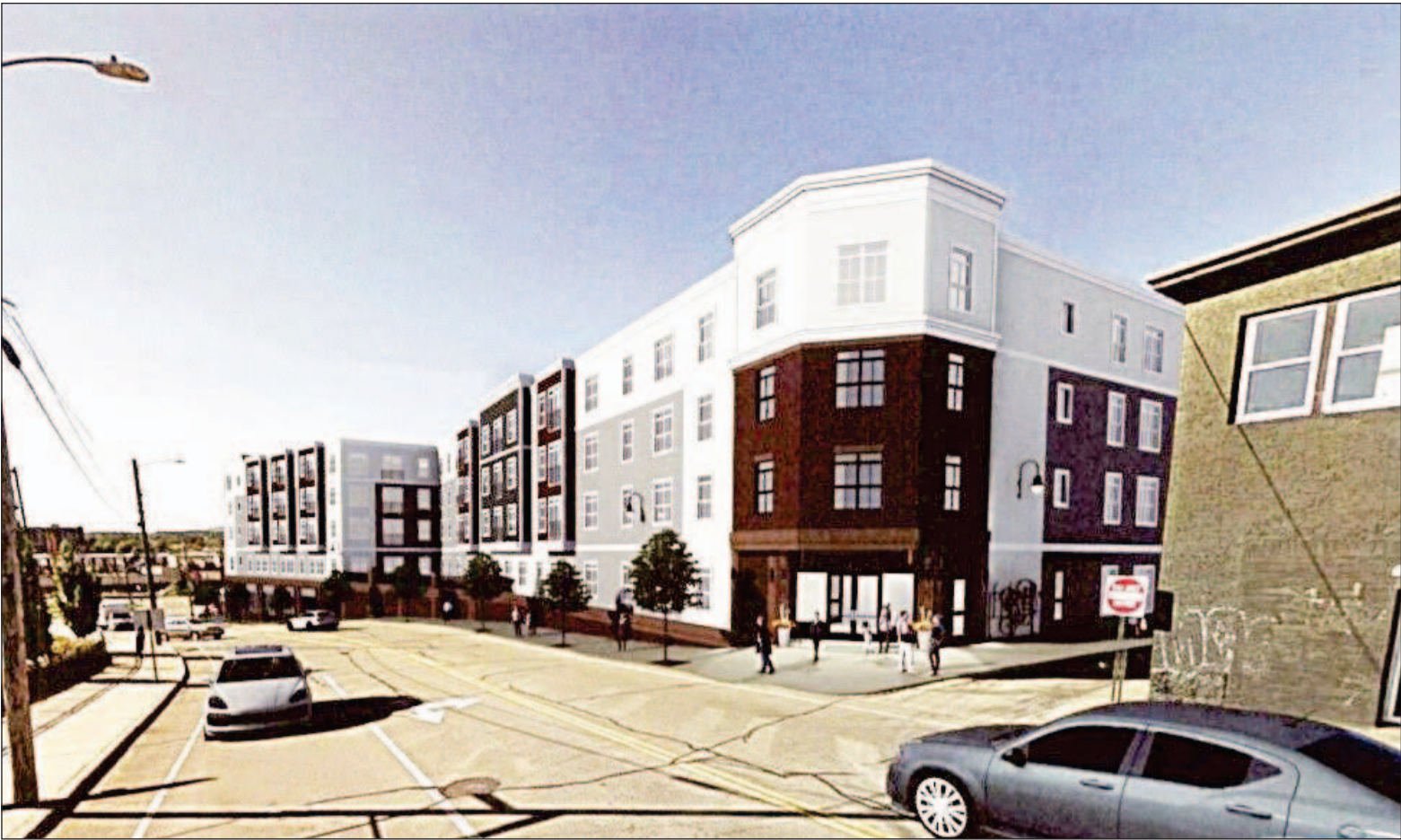
An artist rendering of the 249-apartment complex to be built between West Auburn and Depot streets in Manchester. The view is from Elm Street looking down West Auburn.

On a recent afternoon, Carolyn Gamache was pulling drywall off a third-floor wall at 530 Chestnut St. The 1960 office building is being turned into 12 apartments, complete with plank flooring and stainless-steel appliances. Each unit will have a dishwasher and its own washer and dryer. The same was done to 540 Chestnut, with units now renting for between $1,650 and $2,000. The $2,000 units include two bedrooms and two baths. The new units are expected to be done this fall after being completely gutted. “We went with the times and noticed (the office space) wasn’t working anymore,” Gamache said. The company also is converting parts of two other commercial buildings on Lowell Street into apartments, including 50 units at the Wellington Trade Center. The second bedroom in some of the units can be used as an office. Developer Ben Gamache said some of the tenants in 540 Chestnut receive stipends from their companies to work from home. The tenants like being near downtown and having at least one parking space, said Shawna Lavoie, property manager. A second space goes for $60 extra a month. “The building has a lot of younger workers,” she said. “I think a lot of them are 50/50.