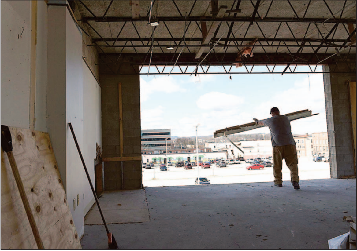
A laborer tosses scrap wood into a dumpster at an apartment conversion project in downtown Manchester last week. Developers say the cost and availability of materials helps make building “affordable” rentals financially viable.