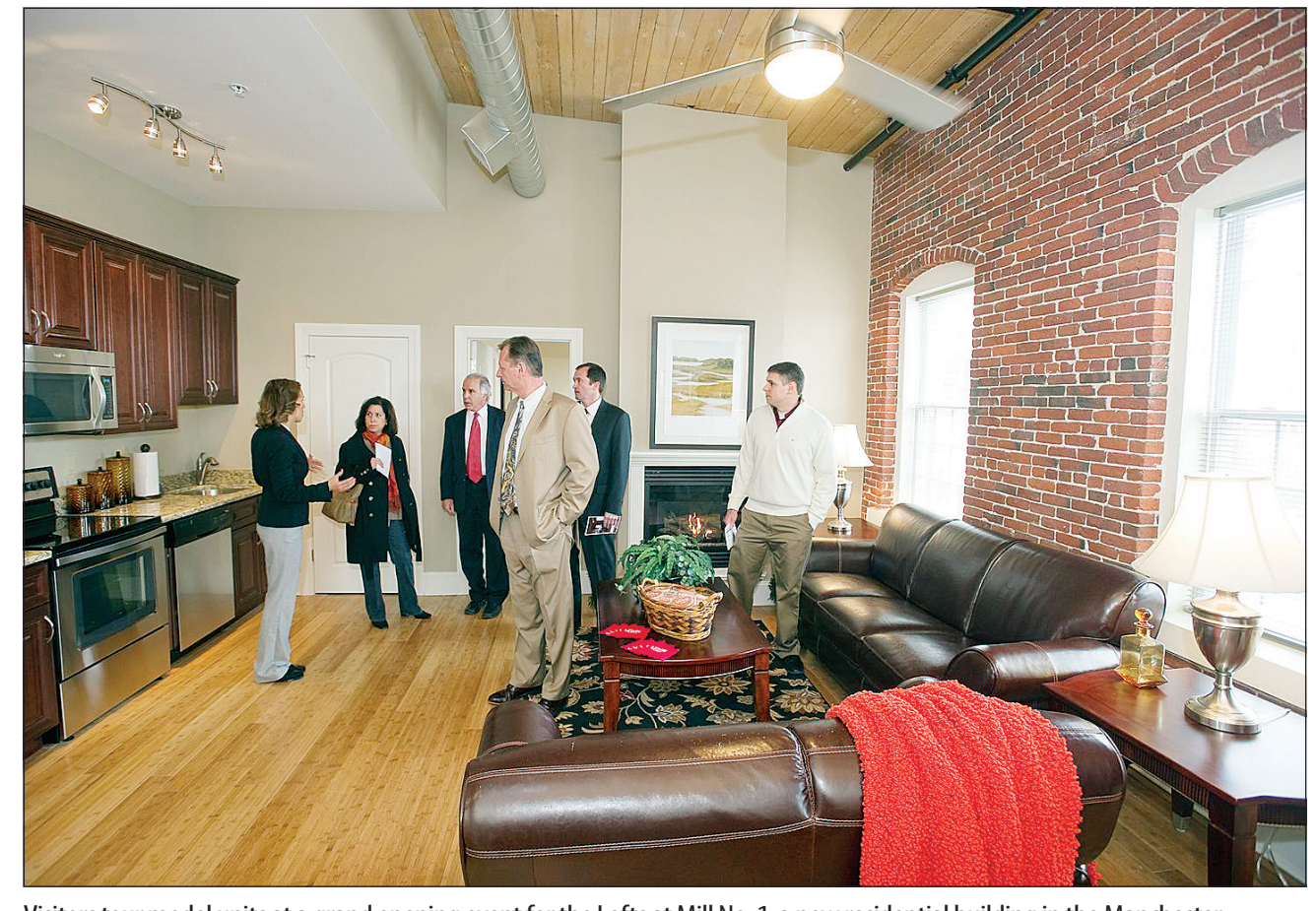
Visitors tour model units at a grand opening event for the Lofts at Mill No. 1, a new residential building in the Manchester