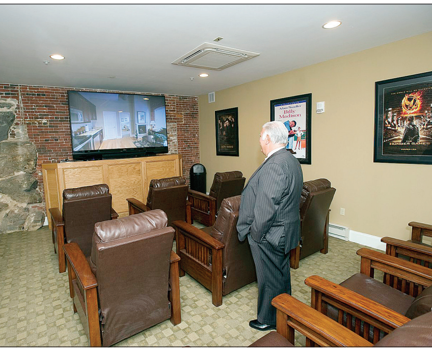
Mayor Ted Gatsas checks out the small movie theater room at a grand opening event for the Lofts at Mill No. 1, a new residential building in the Manchester Millyard.

The units include exposed brick walls and heating ducts, hardwood floors, stainless-steel appliances, granite countertops, track lighting and