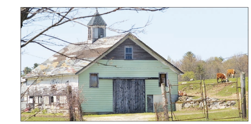
Barn and cattle at the Giovagnoli Farm, South Mammoth Road